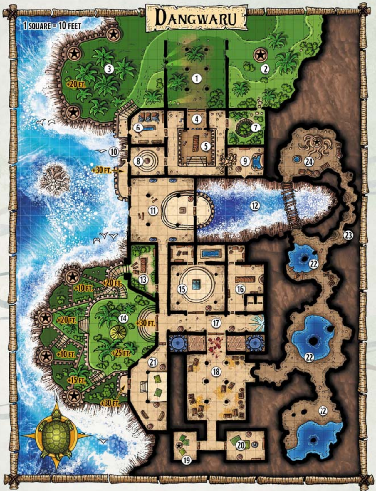
MAP 3: DANGWARU