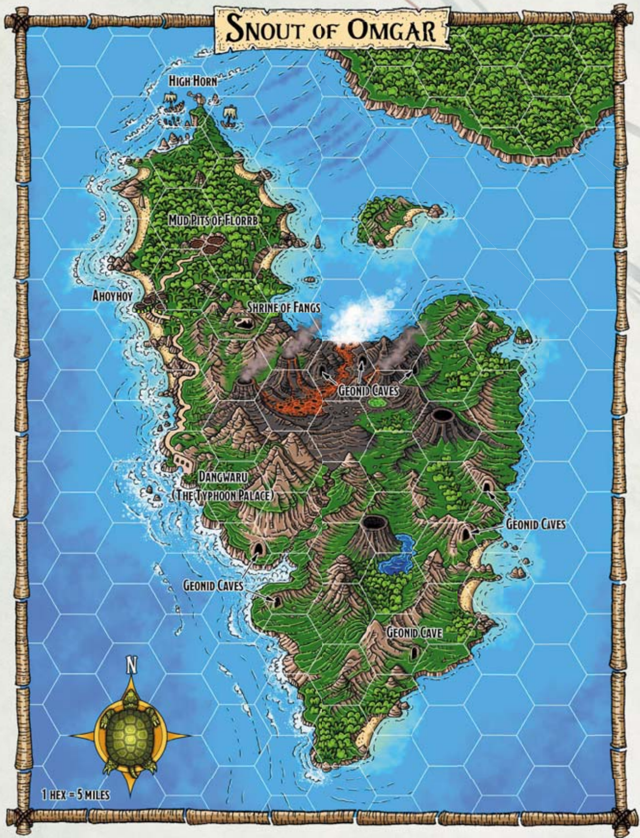
MAP 1: SNOUT OF OMGAR